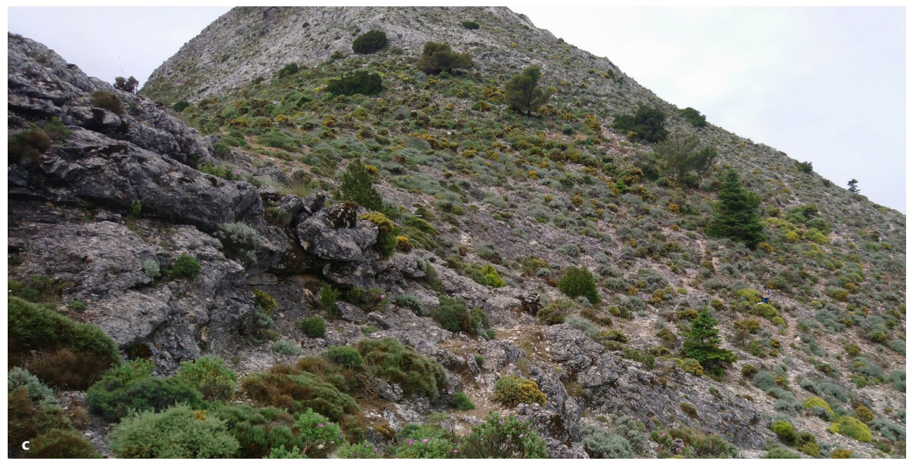
Figure 5. a. Map of the Iberian Peninsula, highlighting the known distribution of Dasypoda radchenkoi sp. nov. in yellow. Black dots represent localities where other Heterodasypoda have been recorded, and grey dots represent past records of D. morotei Quills (based on Ghisbain et al. , 2021b). Revision of the southernmost records of the specimens attributed to the latter species are essential to assess their possible conspecificity with D. radchenkoi sp. nov. b–c. Sierra de las Nieves, mountain peak south of Pinsapo Escalereta (36.6610N, 5.0411W) where most specimens of Dasypoda radchenkoi sp. nov. from this study were collected (Spain, Andalusia, Málaga).