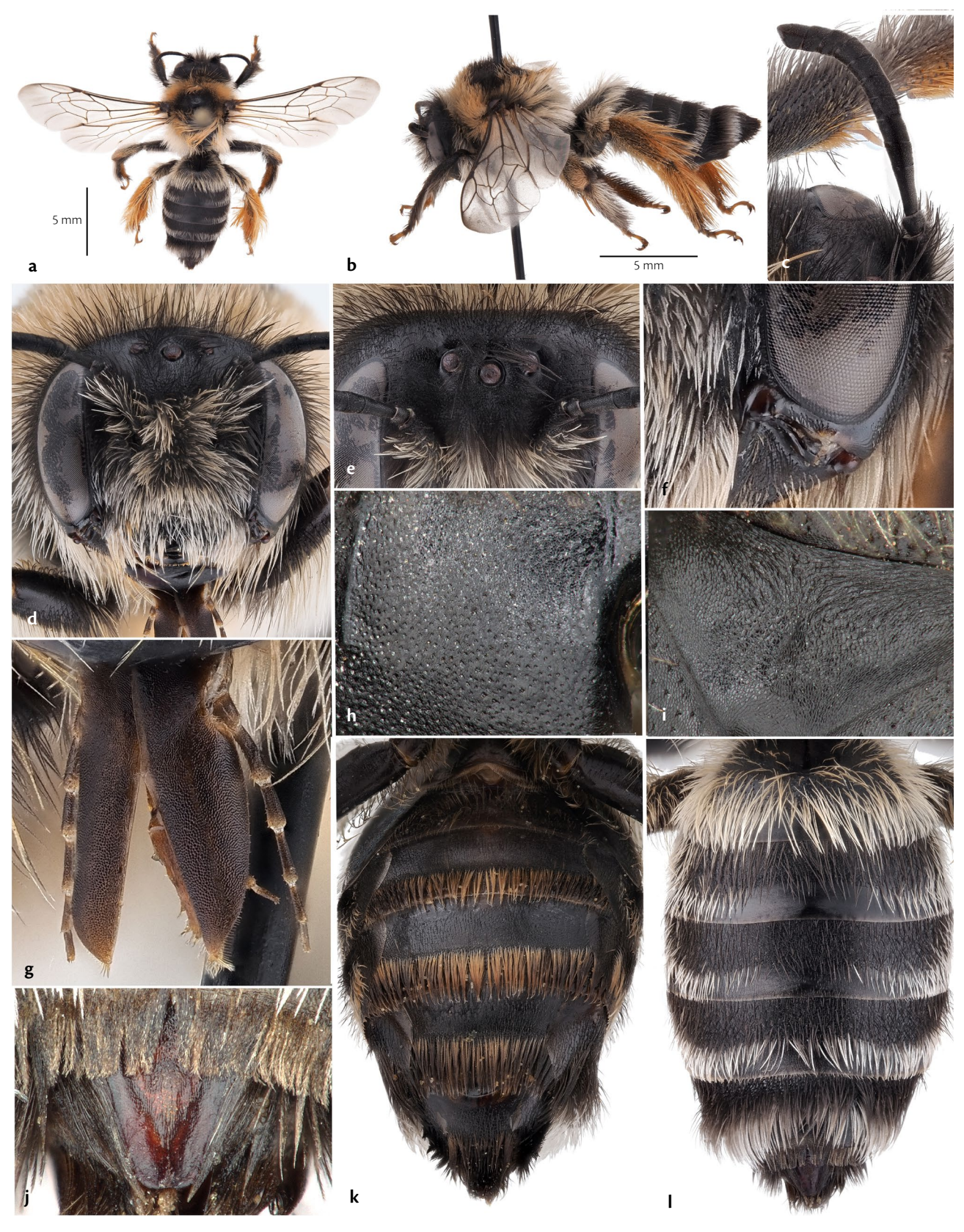
Figure 2. Female of Dasypoda radchenkoi sp. nov. a. Dorsal view. b. Lateral view. c. Antenna. d. Head in frontal view. e. Vertex and ocellar field. f. Left malar space. g. Galea and maxillary palps in lateral view. h. Sculpture of the scutum. i. Sculpture of the propodeum. j. Pygidial plate. k. Metasoma in ventral view. l. Metasoma in dorsal view.

other tarsomeres orange. Claws orange basally and dark brown apically, with strong internal tooth.