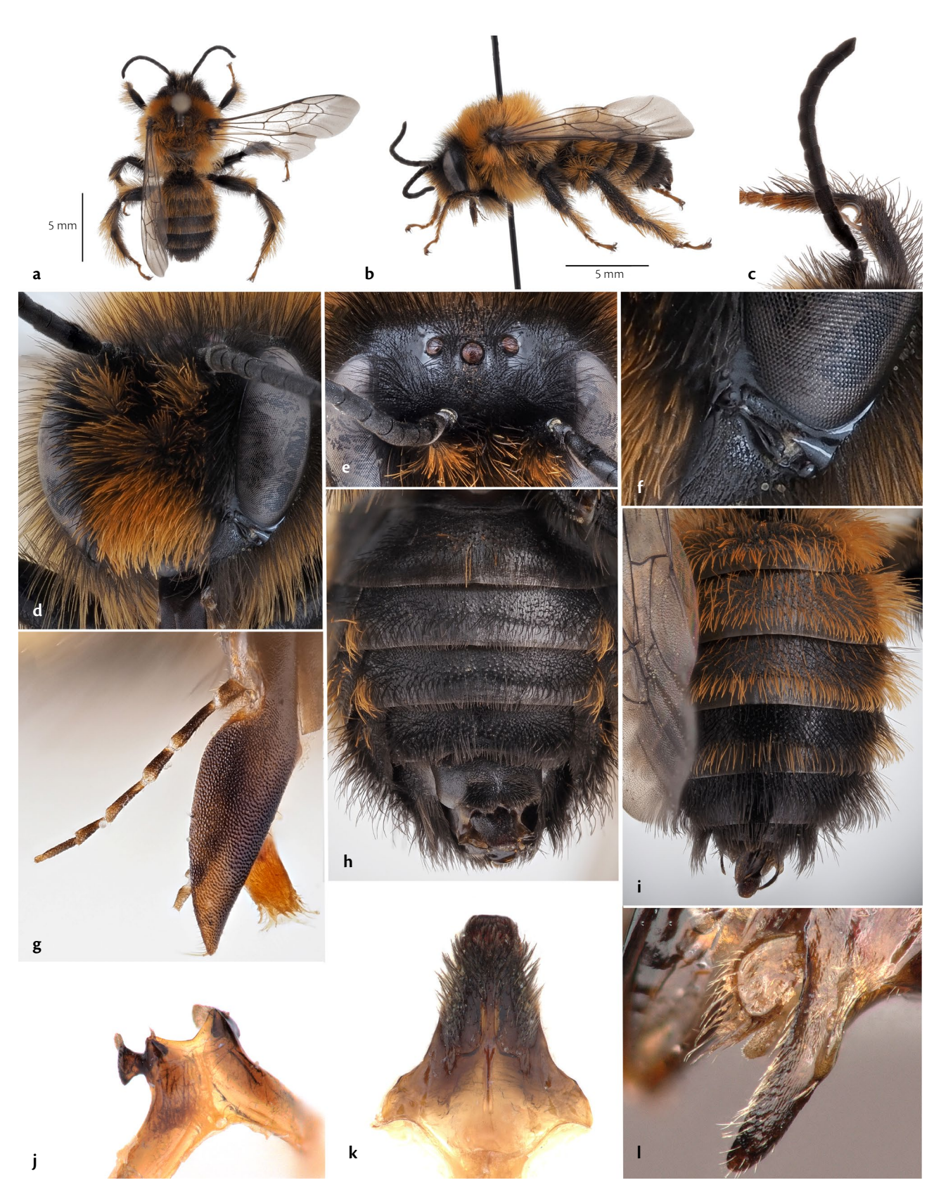
Figure 3. Male of Dasypoda radchenkoi sp. nov. a. Dorsal view. b. Lateral view. c. Antenna. d. Head in oblique view. e. Vertex and ocellar field. f. Left malar space. g. Galea and maxillary palp in lateral view. h. Metasoma in ventral view. i. Metasoma in dorsal view. j. Sternite 7 in ventral view. k. Sternite 8 in ventral view. l. Genitalia in lateral view with a focus on the lobes of the gonostylus.

pilosity (figure 2j). Surface of all sterna strongly shagreened, discs covered with very short, whitish-orangish adpressed pilosity, apically with dense bands of brown-orange hairs with exception of S6 entirely covered with longer dark brown hairs (figure 2k).