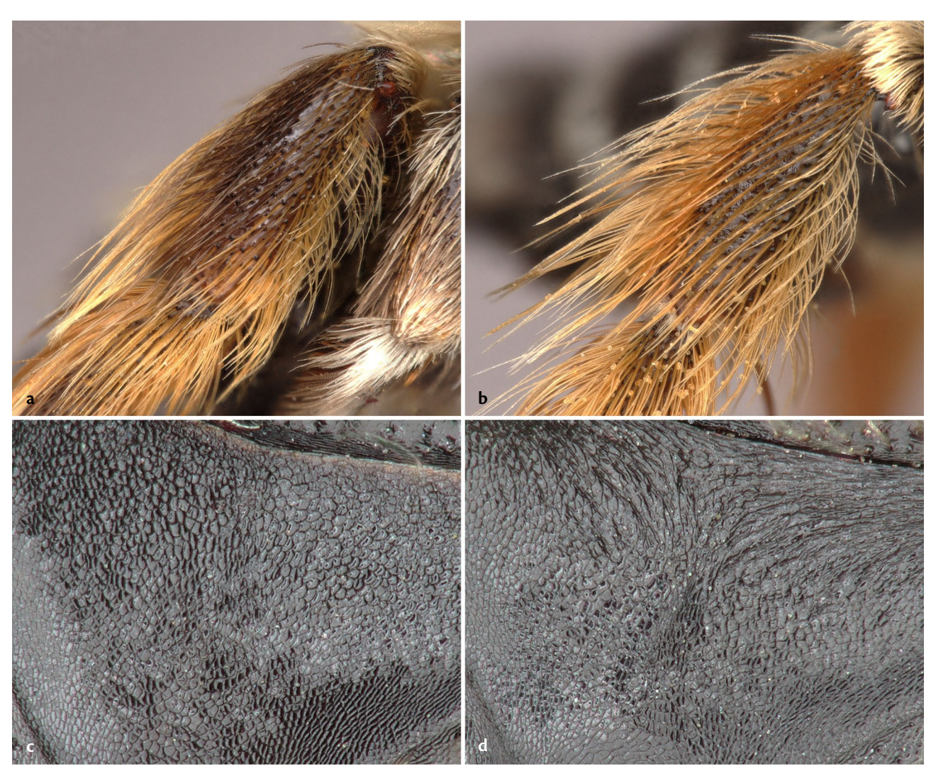
Figure 4. a. Scopa of the metatibia of a D. morotei female, with its typical brown and orangecoloration. b. Scopa of the metatibia of the female paratype of D. radchenkoi sp. nov., with its typical fully orange coloration. c. Sculpture of the propodeum of a female of D. morotei . d. Sculpture of the propodeum of the female holotype of D. radchenkoi sp. nov, with its diagnostic basal ridges (upper part of the image).

average in D. morotei than in D. radchenkoi sp. nov. D. morotei can have small depressions at the base of S8 (illustrated in RADCHENKO, 2017) while this part of the S8 seems straighter on average in D. radchenkoi (figure 3k).